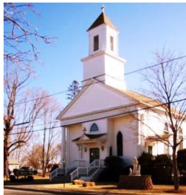
St. Mary Oratory 11 Lincoln St. Brookfield, MA 01506